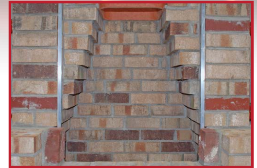
Exposed smoke chamber walls before Cerfractory Foam application