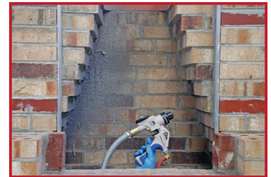
Cerfractory Foam application seals gaps, cracks, holes and streamlines smoke chamber walls