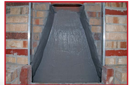
Smoke chamber walls after being parged smooth with Cerfractory Foam.